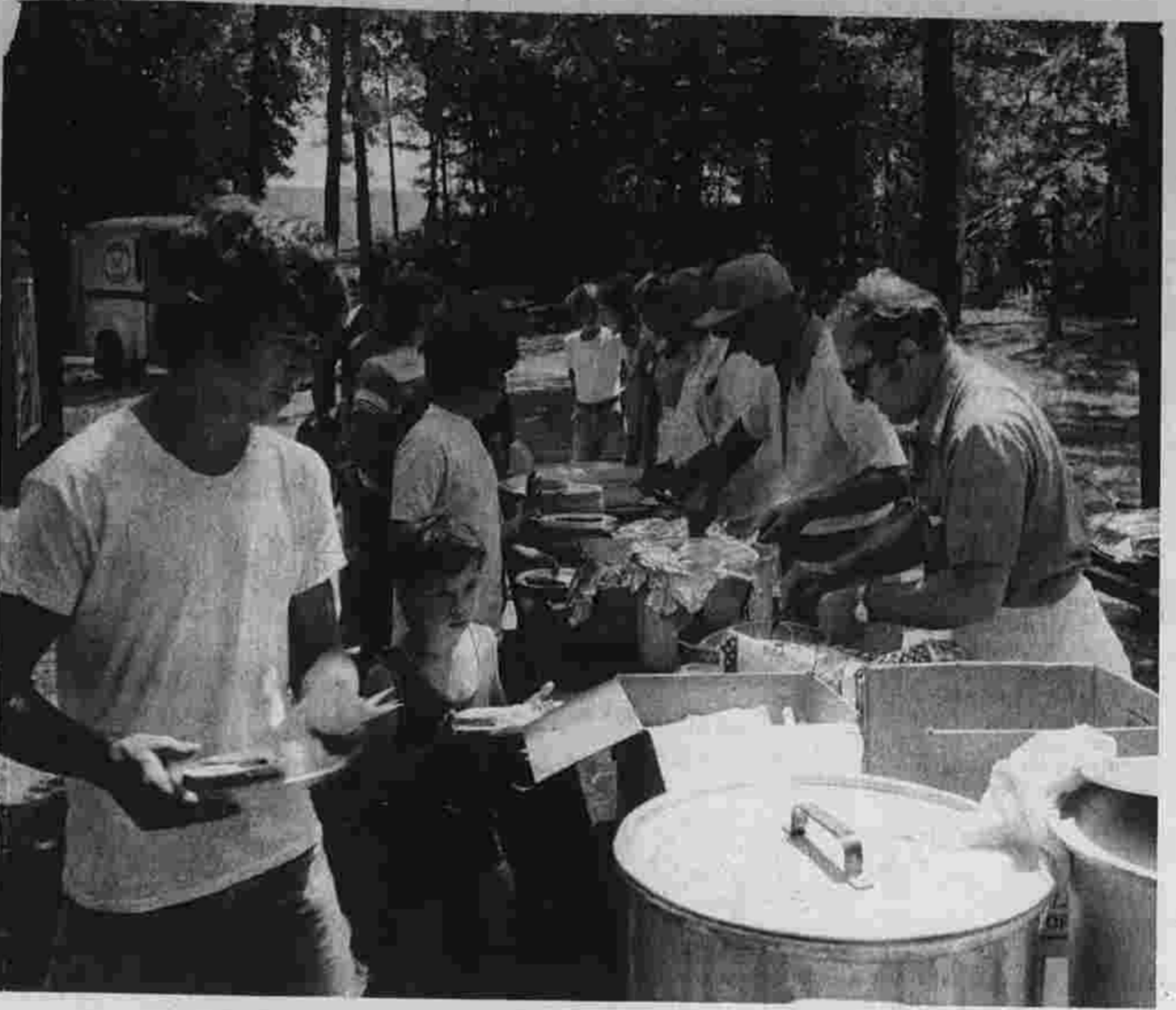
Army & Navy Club Treats Campers

Ever since Camp Kennedy opened in 1964, the Manchester Army & Navy Club has treated the campers and staff to an annual full-course luncheon, near the end of the camping season. The meat loaf luncheon served up Thursday (the camp closed today) proved to be in the A-N Club's delicious tradition.